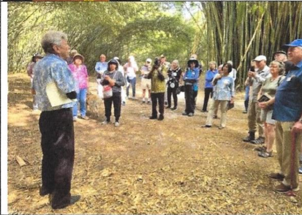
"The Establishment of Kanapaha Botanical Gardens"