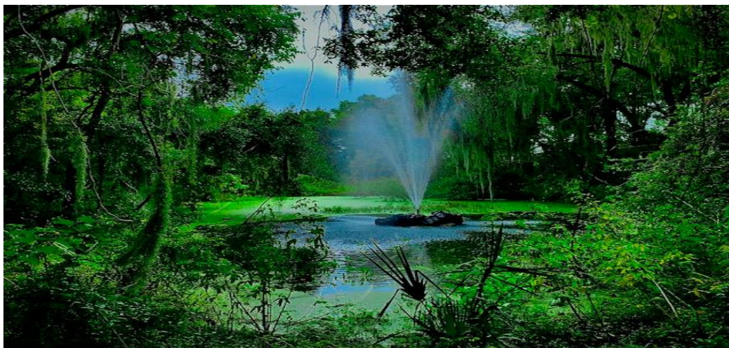
On the nature walk between the TREEO Center and the Veterans Memorial.